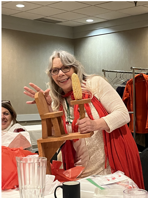
Zoule loved her squirrel feeder.