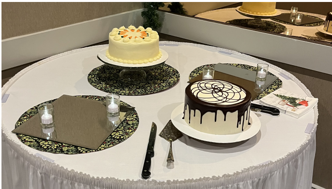
Yummy Carrot cake and Chocolate cake for desert!