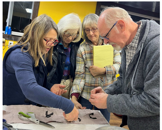
Checking different machine feet for sewing zippers