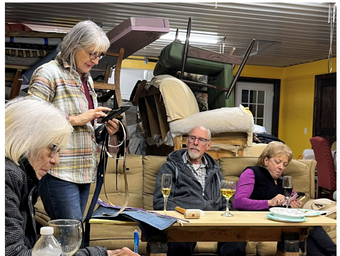
Sharing the history of zippers