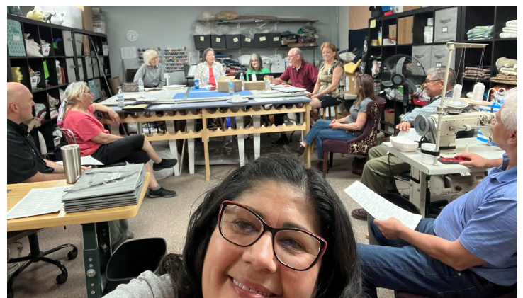
April PUAM Meeting at Twin Cities Upholstery & Workroom.

IF YOU SEE ME TALKING TO MYSELF, JUST MOVE ALONG. I'M SELF EMPLOYED, WE'RE HAVING A STAFF MEETING.