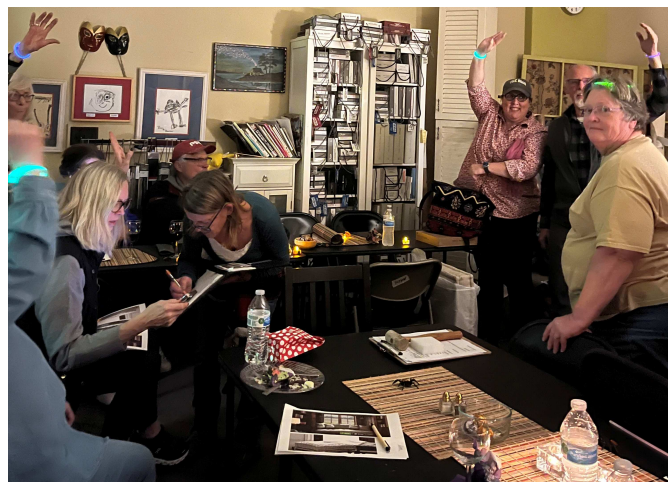
Showing off our Glow Sticks from Mavis.